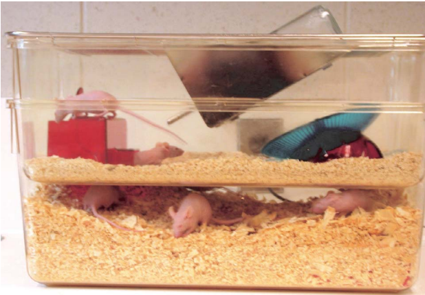
Figure 3: Godbey and Gray created a 2-tiered mouse cage by stacking a mouse cage into a rat cage and filling the bottom cage with bedding substrate.

mice placed a larger distance between their nesting and soiling sites and carried the bulk of their bedding material from the nesting and neutral sites into the latrine area. Mice also avoided urinating and defecating close to their nest. The scientific literature abounds with anecdotal evidence that mice prefer to segregate their space into clean and dirty areas. For example, Sherwin [89] observed that mice will defecate in a highly localized area when provided with a demarcated space, such as a glass dish. Others have observed that when empty bottles were added to a mouse cage as novel environmental enrichment, mice would use these as enclosed latrines or nesting areas [90, 91]. In studies on mouse preferences for bedding, mice were found to eliminate least in the cages that contained their preferred bedding type (ie, where they rested) [37]. Anecdotal evidence suggests that rats also prefer to eliminate away from areas where they rest [37, 55, 72, 74].