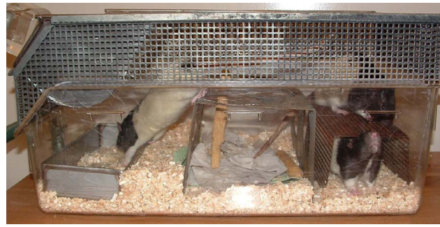
Figure 2: van der Harst and colleagues added structural complexity and 45% more usable space by furnishing rat cages with tunnels, shelters, and a raised lid.

A simple and relatively inexpensive way of increasing the complexity of a standard laboratory cage is through the addition of cage dividers. Anzaldo and colleagues [80] found that male rats preferred a cage with 2 L-shaped dividers compared with no dividers. In a more elaborate experiment, Chamove [81] partitioned standard mouse cages into 5 or 9 alleys using a combination of transparent and opaque Perspex. The dividers, inserted lengthwise, had small cut-outs at alternating ends, such that mice had to travel the length of the cage 5 or 9 times to get from one end of the cage to the other. A third set-up, dubbed the savannah cage, had 9 alleys but was also divided horizontally halfway through its height with a flat piece of Perspex. As a result, there were “burrows” in the lower half and an open “savannah” in the upper half of the cage. The horizontal divider had a small hole so that mice could travel between the 2 levels. In preference tests, male and female mice had a clear preference for increasing complexity, with the savannah cage being the favorite. Mice reared from weaning in the more complex cages had better weight gain after weaning, lower adrenal weights, were more active in their home cages, had shorter latencies