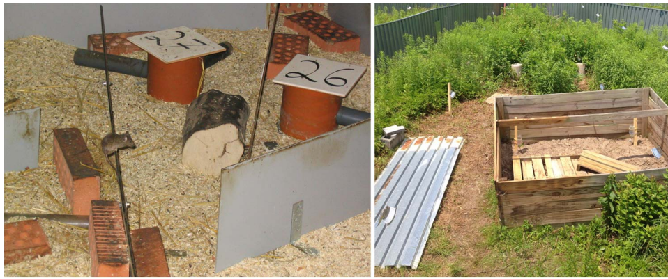
Figure 7: Free-ranging housing options for mice. Left: König conducts experiments with mice living in a barn; mice are free to enter or leave the barn at will through small holes in the walls. Right: Graham houses mice in fenced outdoor enclosures where they can build burrows and forage on vegetation. Mice cannot leave the enclosures.

successful, the animals are food restricted and fed a significant portion of their daily ration during testing. Free-roaming monkeys are able to eat whenever they want, so researchers use methods that do not require the use of food rewards, such as the looking time method (individuals will gaze longer at events that differ from physical or social norms) that is minimally disruptive and was developed for use with human infants. Using the same method with monkeys as is used with infants also provides a better basis to compare performance between species [123].