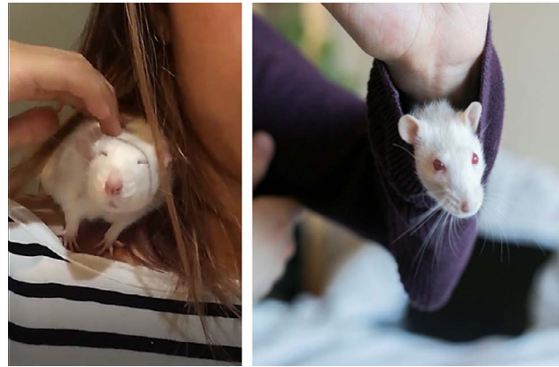
Figure 8: Two Sprague-Dawley female rats who were adopted from a laboratory at the age of 11 months. Left: Clementine receiving head scratches while sitting on her guardian's shoulder. Right: Gizmo frequently rests inside her guardian's sleeve.

Even adult rodents who have not been socialized during their time in the laboratory may be suitable candidates for adoption following a short socialization period before adoption. For example, poorly socialized 9-month-old rats were transferred to our