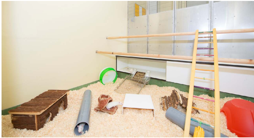
Figure 6: Playroom for rats. Groups of up to 10 rats were rotated through the room every week.

with (especially for inexperienced students) and seemed more emotionally stable and better able to adapt to new experimental tasks. Young (100–200 g) rats were pair-housed in standard cages but placed in a large playpen for 2 to 6 hours each day in groups of approximately 30 animals. The rats were then returned to their home cages in random pairings. No aggression was observed, likely because the rats were busy engaging with the stimulating environment. The playpen floor measured 80 × 45 cm and was 35 high; it contained tree branches, ramps and ladders, pipes, chains, metal coils, and hanging baskets. After playing, the rats retired to the pipes, allowing the animals to be moved with relative ease.